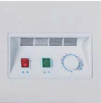
Adjustable temperature Front ON-OFF switch