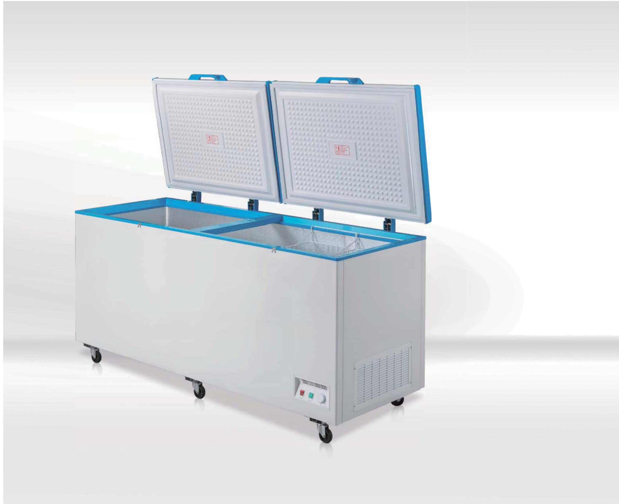
CHEST FREEZER UP TO 508 LITRE