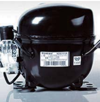
High efficiency compressor