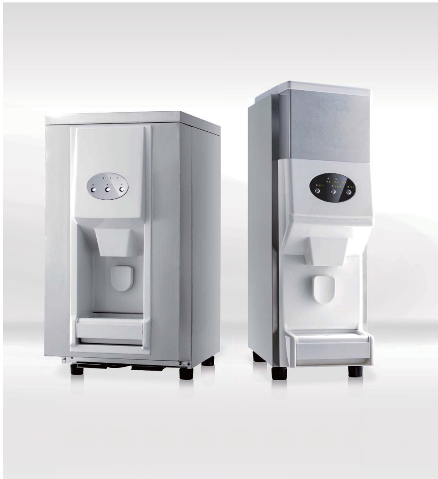
ICE WATER DISPENSER UP TO 14/24KG

Ice, water dispenser, Inspires your life.