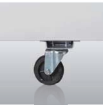
Castor wheels for easy movement