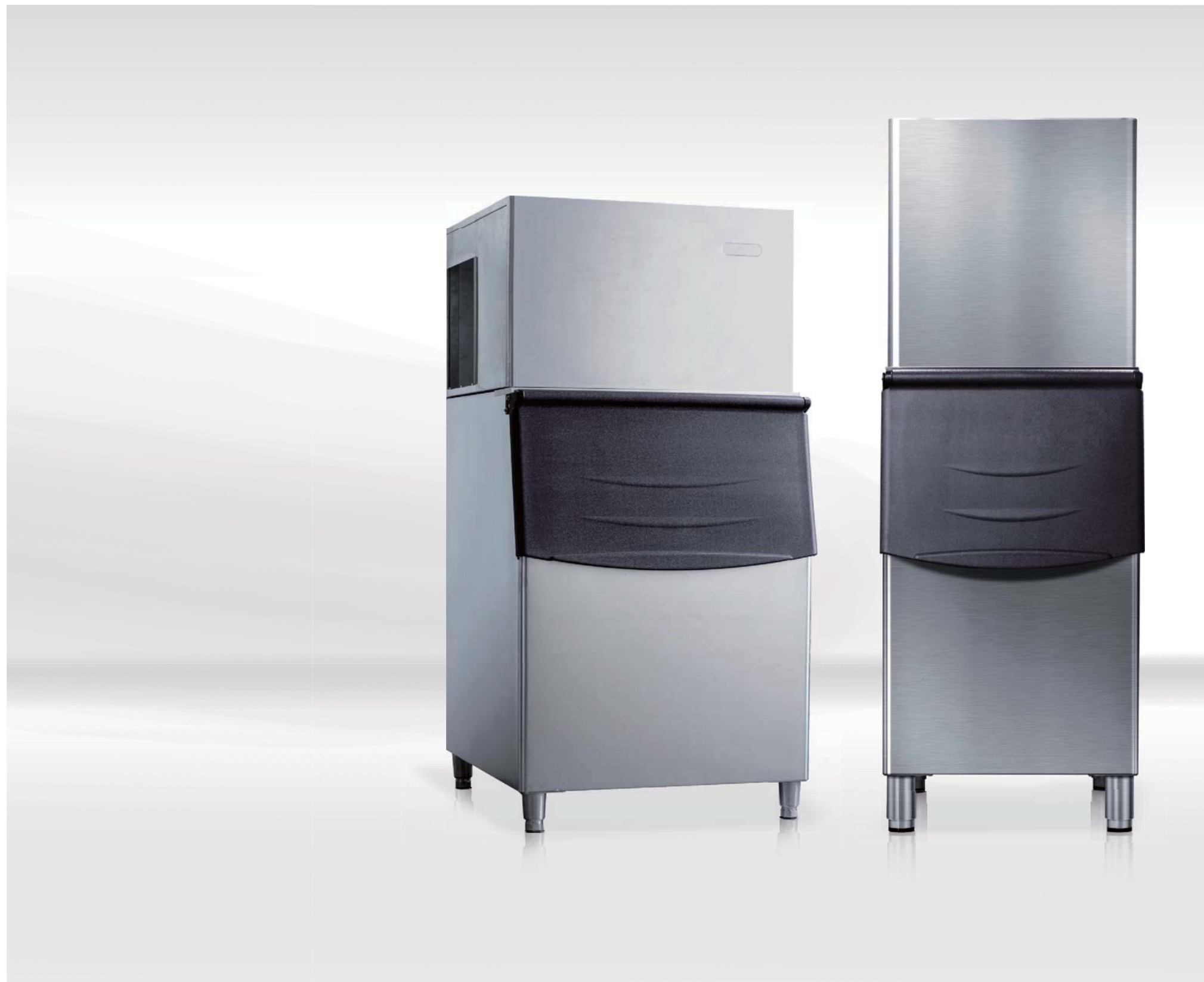
MODULAR ICE MAKER UP TO 130/208KG